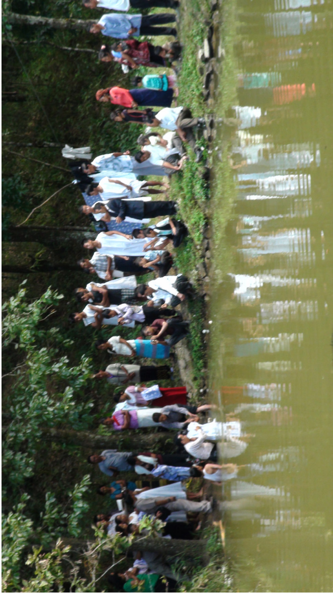
Champhai Bial Danial Pâwl bultûma Camping nëihna ràhchhuah, mi 27-in baptisma an chang